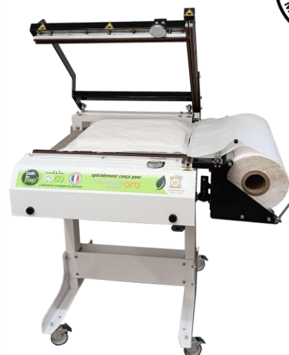
PP 5060 M-P pneumatic closure + motorised feet (optional)