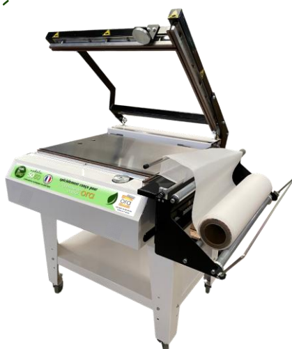
PP 5060 M manual closure