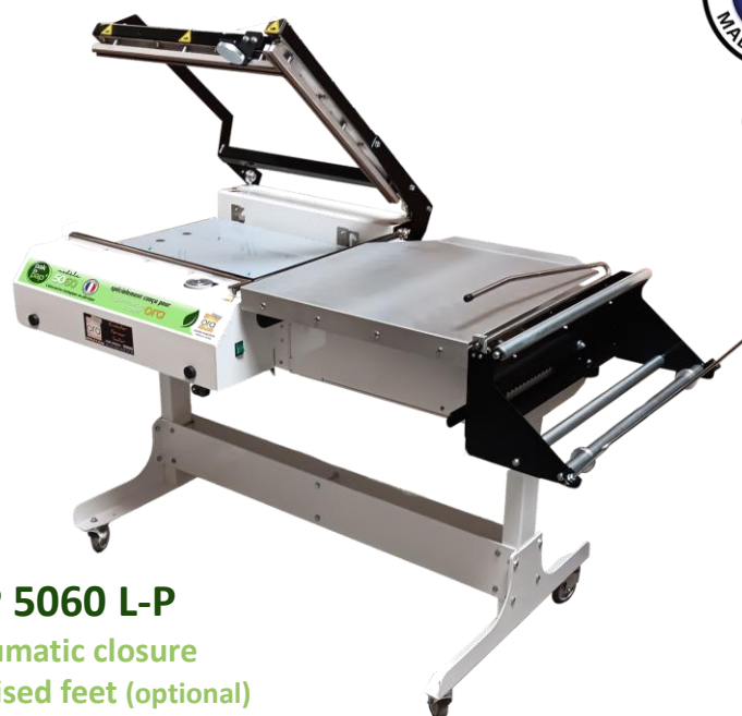
PP 5060 L-P pneumatic closure + motorised feet (optional)